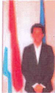
Chairman & Founder of